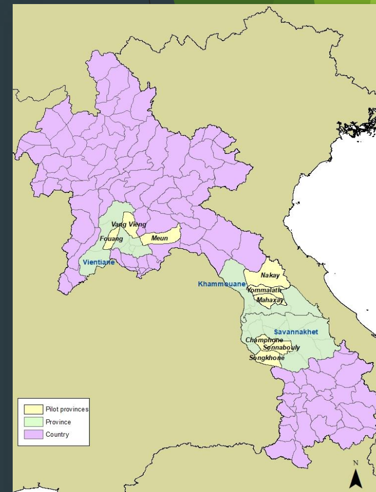
SRI-LMB action research sites in 3 selected provinces of Lao PDR

As per the independent Monitoring Evaluation and Learning study, the most widely adopted SRI practices by the FPAR farmers were transplanting using fewer seedlings (1 to 3) per hill, and wider spacing (>20 cm).